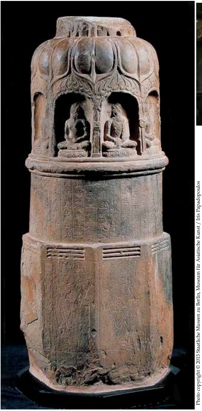
Fig. 5. Stupa, found in Kocho (Gaochang), stone, 5<sup>th</sup> century CE, III 6838

east Asian galleries. Visitors can imagine that they are on an imaginary journey from India to China or the other way round: there will be two entrances to the exhibitions. Coming from the South Asian galleries visitors will be able to learn much about the origins of Buddhism and Buddhist iconography. Key themes such as the stupa will be familiar to them by the time they arrive in this room, where the famous stone stupa found in Kocho will be a key object [Fig. 5]. Coming from the other direction visitors will be perhaps surprised to find Chinese manuscripts and recognize the