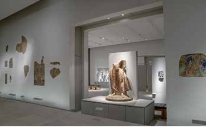
Fig. 3. View from the Central Asia Gallery towards Buddhas from Gandhara.

jects, and without the catalogue or an audio guide the average visitor might find it difficult to understand the background to the complexities of languages and religions of the vast areas of the world represented in these rooms. On a personal note however, I shall miss the possibility to look into neighboring displays from the Central Asian gallery, for example on the origins of the Buddha figure in Gandhara [Fig. 3]. In the galleries in Dahlem, emphasis has been on the opening of space causing anticipation - in contrast to corridors and separated rooms