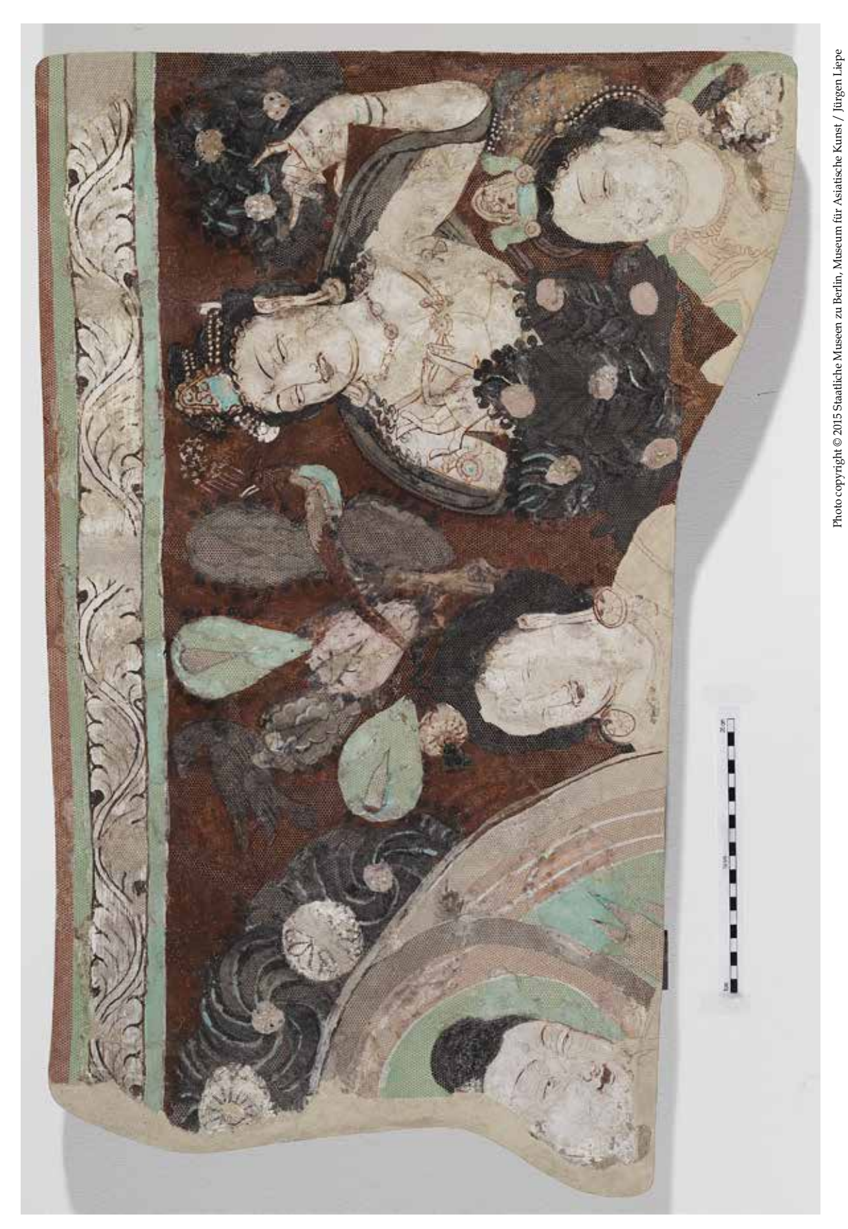
Plate VI — [Russell-Smith, "Berlin's 'Turfan Collection'," p. 156]

Detail of a preaching scene from the Painter's Cave (Kizil Cave 207, ca. 6<sup>th</sup> century CE), III 9148 b.