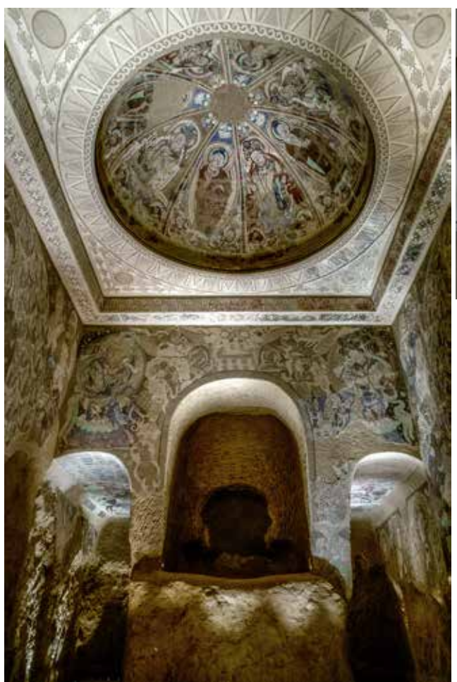
Fig. 2. Cave of the Ringbearing Doves (Kizil Cave 123) as reconstructed in Dahlem.

to present the collections differently in the Humboldt Forum followed.<sup>5</sup> The Asian Art Museum was both praised and criticized for the beautiful galleries in Dahlem, which opened in 2000 (then still as the Museum of Indian Art, designed under the leadership of then Director, Marianne Yaldiz) after a two-year closure. Emphasis has been on the beauty of the ob-