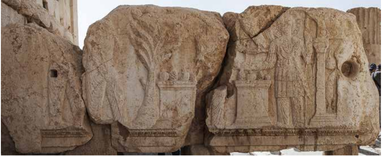
Two fragments of sculpted pediments, displayed just outside the entrance to the cella of the Temple of Bel. Fate uncertain, but likely destroyed.