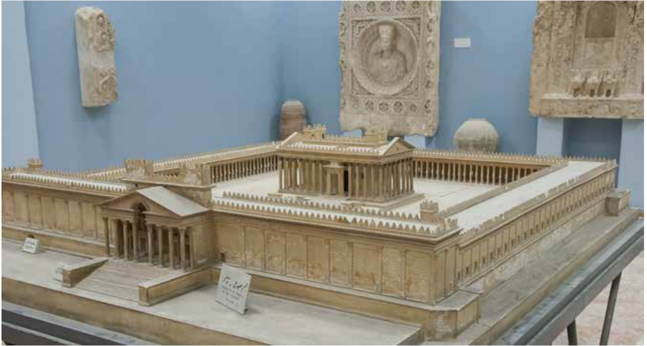
The Temple of Bel: (above) a model in the Palmyra Museum reconstructing its original appearance, and (below) the central cella, now destroyed.