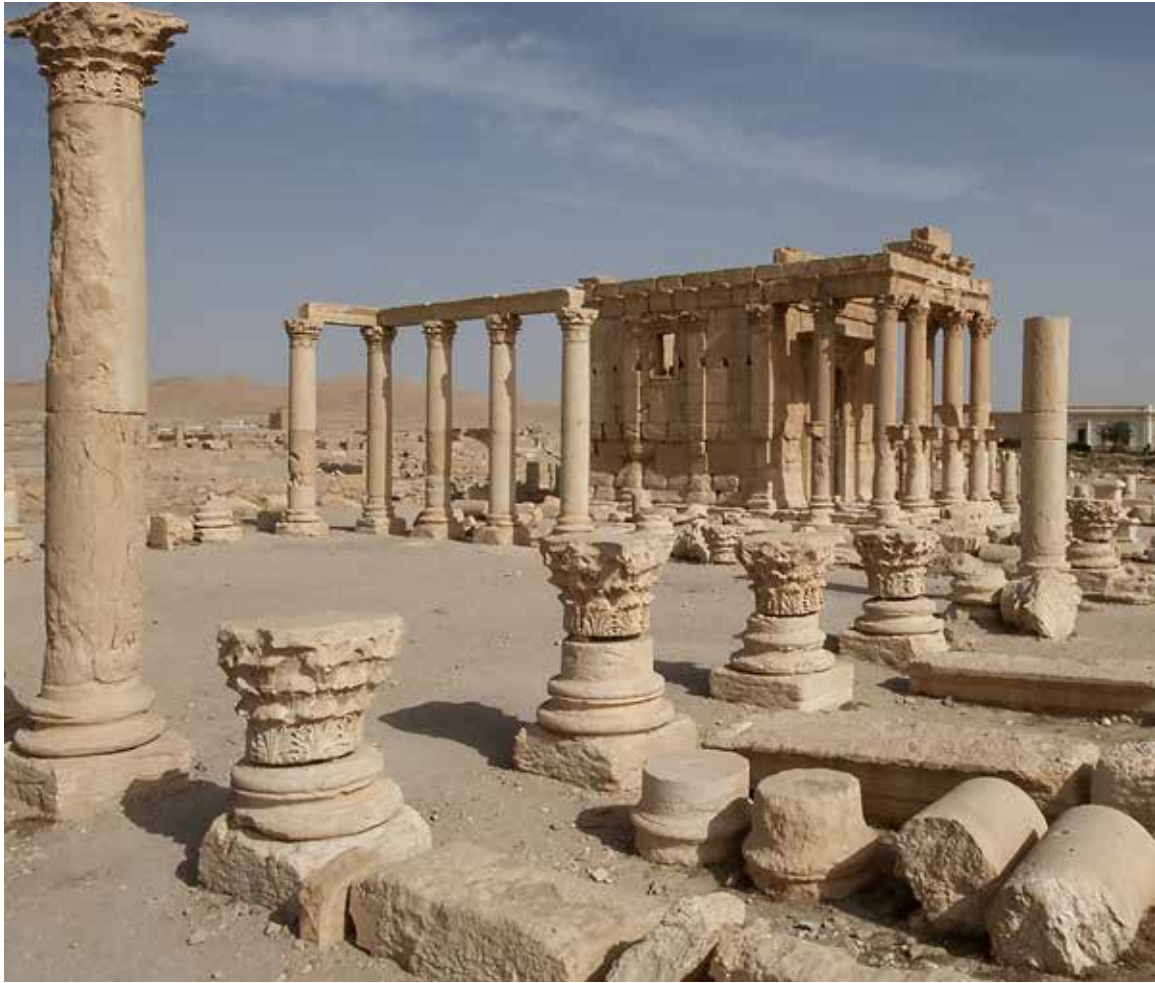
(above): Temple of Baal-Shamin, now destroyed; (below): The Qalaat Shirkuh castle and the Temple of Baal-Shamin.