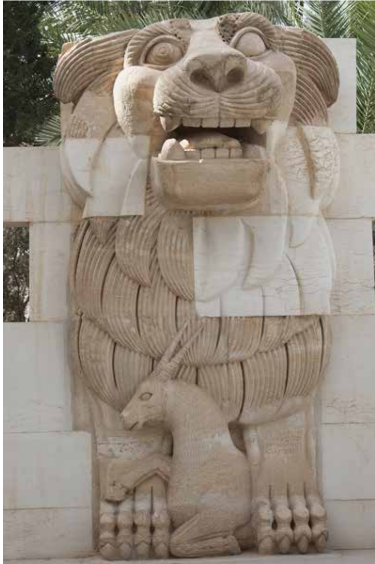
Now destroyed lion statue found at the Temple of Al-lat, displayed outside the Palmyra Museum. A copy is on display outside the National Museum in Damascus.

Note on the photographs: All of the photos on site in Palmyra were taken in October 2010 by Daniel C. Waugh. The photos from museum collections on the next page are also by Daniel C. Waugh, the museums housing the sculptures including: the Palmyra Museum, the National Museum (Damascus), the Louvre (Paris), the British Museum (London), the Ashmolean Museum (Oxford), the Altes Museum (Berlin), the Glyptoteket (Copenhagen), the Archaeological Museum (Istanbul), and the Archaeological Museum (Gaziantep).