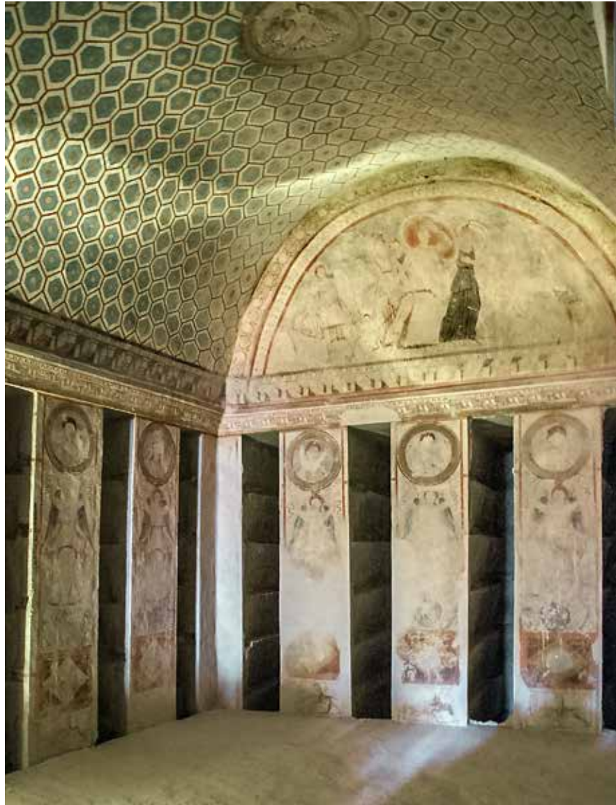
(above): Tomb of the Three Brothers, fate unknown. (below): Interior of the destroyed tower tomb of Elahbel.