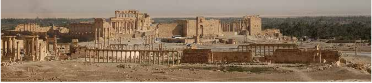
View toward the Temple of Bel.