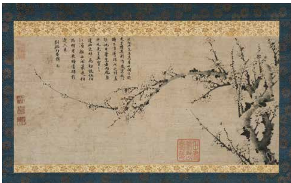
Fig. 26. "A branch of the cold season," by Yang Hui 楊輝, ca. 1440. Ink on paper. Overall: 30 5 / 16 x 56 1 / 16 in. (77 x 142.4 cm); image: 12 3 / 16 x 25 in. (30.9 x 63.5 cm). Seattle Art Museum, Eugene Fuller Memorial Collection, 51.132.

they have been very responsive. One desideratum here would be for them to obtain permissions to use or link to larger images of the paintings cited for comparison in the essays. Over time, I assume, that will become possible. In general, one of the as yet too rare features of museum collection