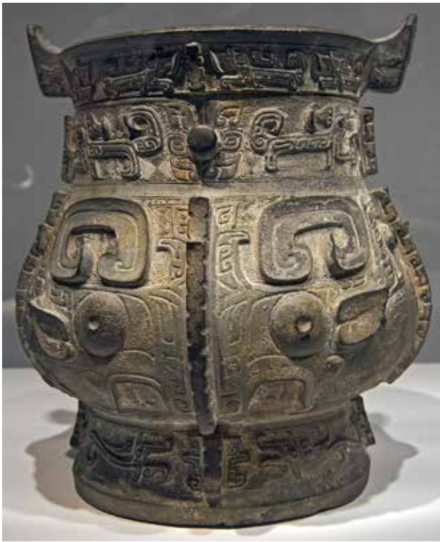
Fig. 15 (above). Bronze you (wine vessel), 11 th century BCE (Western Zhou period). Seattle Art Museum, Eugene Fuller Memorial Collection, 56.33.