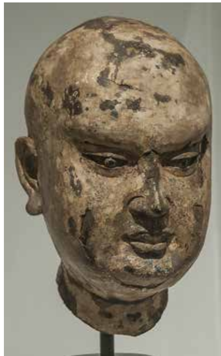
Fig. 32. Head of a Luohan, 10 th -12 th century (Song period). Dry lacquer and glass. H: 17 1/4 in. Eugene Fuller Memorial Collection 40.20.