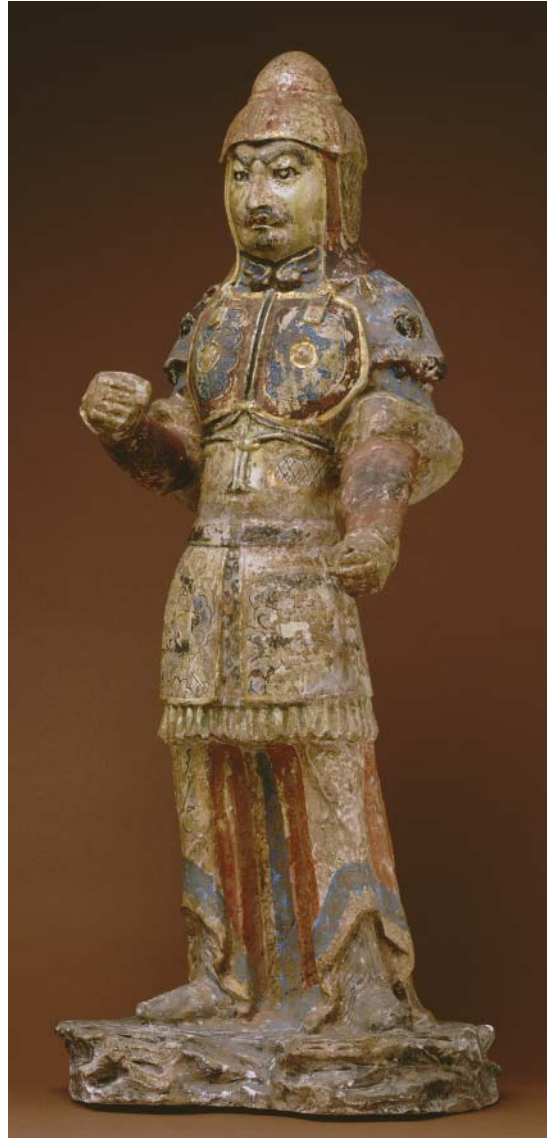
Tomb attendant. Chinese, late 7 th century. Earthenware with glaze, gilt, and paint. 27 1 / 2 x 11 x 10 5 / 8 in. (69.85 x 27.94 x 26.99 cm). Seattle Art Museum, Eugene Fuller Memorial Collection, 35.6.