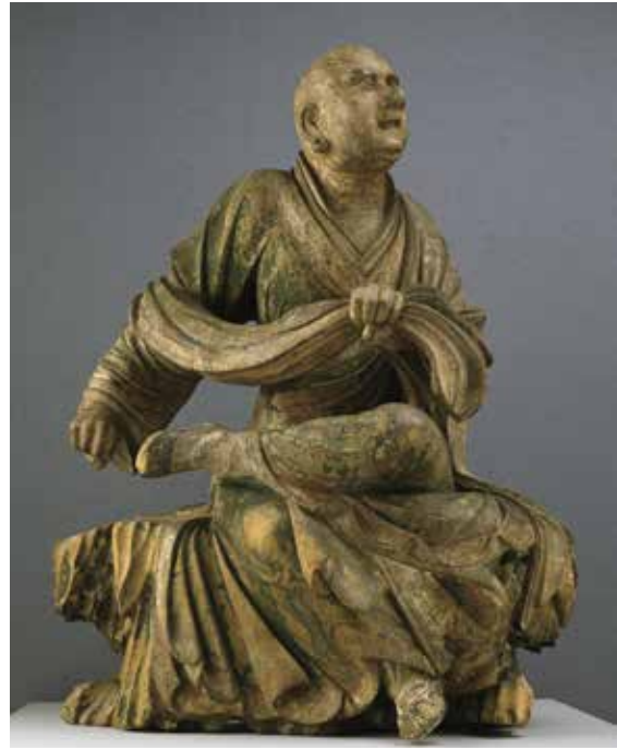
Fig. 9 (top right). Monk at the moment of Enlightenment, Chinese, ca. 14 th century. Wood with polychrome decorations, 41 x 30 x 22 in. (104.14 x 76.2 x 55.88 cm). Seattle Art Museum, Eugene Fuller Memorial Collection, 36.13.