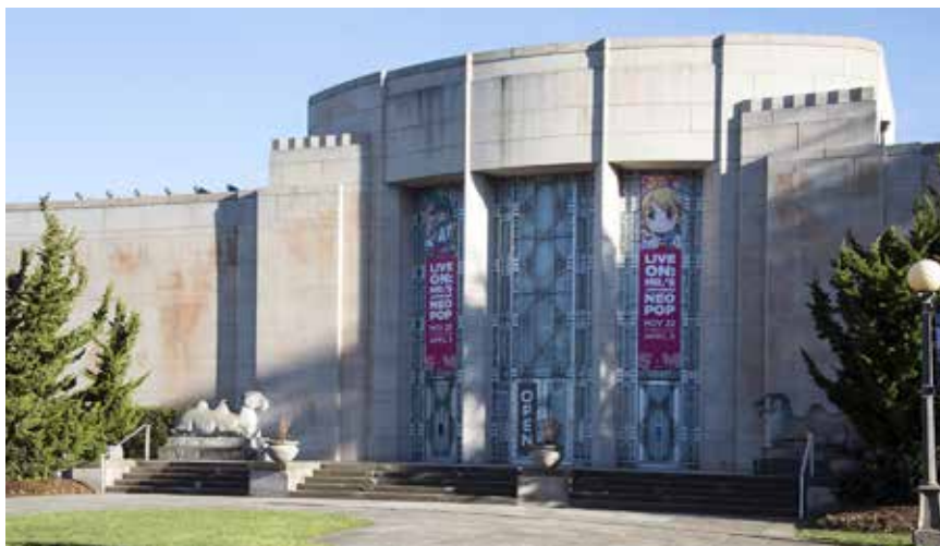
Fig. 7. The entrance to the original building of the Seattle Art Museum, opened on June 23, 1933, as seen today. For a historic photo giving a sense of Fuller’s concept of the “spirit way,” see Yiu, Fig. 27, p. 47.

ing now houses only the Asian collections as the Seattle Asian Art Museum [SAAM]).