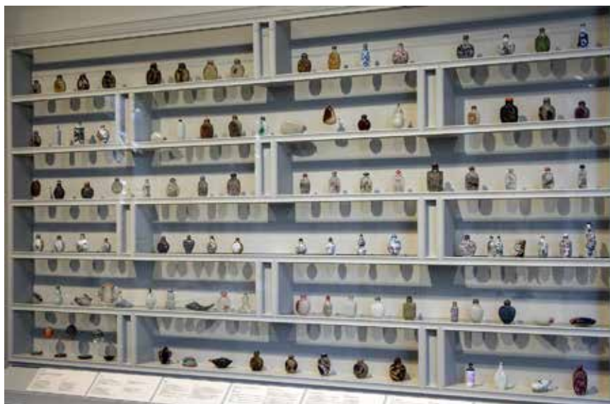
Fig. 29. The display of many of Richard Fuller's snuff bottles, in the Seattle Asian Art Museum.

stands is where the user interested in blue-and-white might well start. But how is he or she to know? If a visitor to Seattle wanted to see its good collection of Asian ceramics he or she should also be aware that what is displayed, but a fraction of the whole, is divided between SAAM and a porcelain room (mainly focused from the European perspective) in the downtown museum. It is in the latter that some of the examples of "kraack" wares, the export blue-and-white of the late Ming period, are to be found. One can, at least, download a pdf file on the porcelain room ahead of a visit, in order to see exactly what is in it. 8 Apart from a rather extensive display of Richard Fuller's snuff bottles in SAAM [Fig. 29], I think that porcelain room is the closest thing we have here to a "study collection." One specifically for Chinese ceramics would be highly desirable.