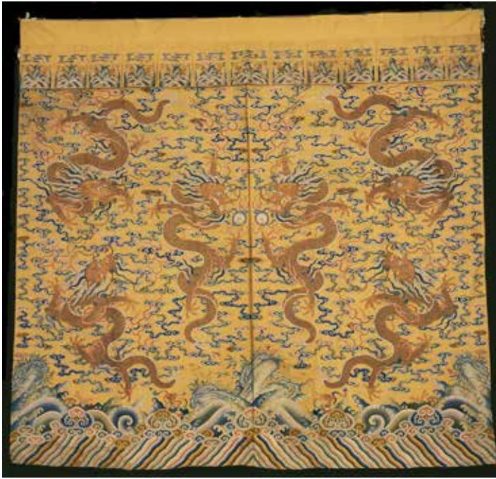
Fig. 8 (left). Bed curtains, Chinese, 1735–1796 (Qianlong period). Silk and gold thread, 107 x 70 3 / 4 in. (266.7 x 179.71 cm). Seattle Art Museum, Eugene Fuller Memorial Collection, 33.159.2.