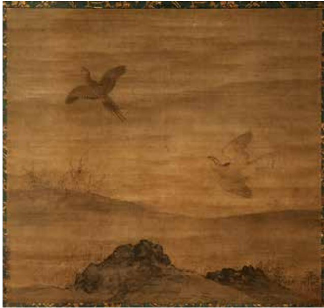
Fig. 11 (above). Hawk pursuing a pheasant, by Li Anzhong 李安忠, 1129–30. Ink and color on silk. Image size: 43 1/2 x 16 in. (25.9 x 26.8 cm). Seattle Art Museum, Gift of Mrs. Donald E. Frederick, 51.38.