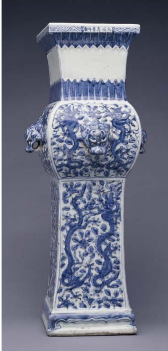
Vase. Chinese, late 16 th – early 17 th century. Porcelain with molded and underglaze-blue decorations. 22 1 / 2 x 9 3 / 4 in. (57.2 x 24.77 cm). Seattle Art Museum, Eugene Fuller Memorial Collection, 54.120.