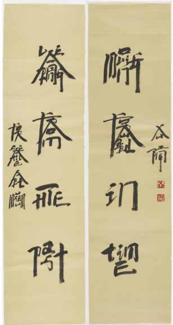
Fig. 14 (right). Couplet: "Learning from the Past, Moving Forward in Time," by Xu Bing 徐冰, 2009. Calligraphy; ink on paper. Dimensions: 53 1/2 x 13 3/4" each sheet. Seattle Art Museum, Gift of the artist in honor of Mimi Gardner Gates, 2010.7.2.