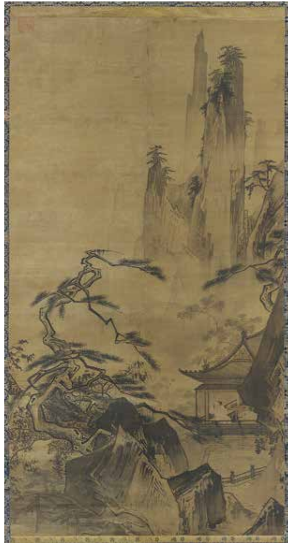
Fig. 10 (right). Scholar gazing at the moon. Ma Yuan 馬遠 Tradition (15 th century). Ink and color on silk. Overall: 116 1 / 4 x 48 5 / 16 in. (295.3 x 122.7 cm); Image: 78 x 41 3 / 4 in. (198.1 x 106 cm). Seattle Art Museum, Eugene Fuller Memorial Collection, 36.12.

[Fig. 10; for detail see below, Fig. 28]. While it then turned out to be a later, Ming work, it remains one of the museum's best paintings. Fuller's cultivation of local patrons in Seattle eventually led to the donation (by Mrs. Donald E. Frederick) of a Song painting that is understandably one of the highlights of the collection [Fig. 11, next page]. Looking back on the time when he was advising the San Francisco Museum of Asian Art on its acquisitions, James Cahill has written somewhat ruefully about how an extraordinary album of landscapes by the innovative late Ming artist Shao Mi 邵彌 [Fig. 12; Color Plate XIII], ended up in Seattle when he could not persuade the decision-makers in San Francisco that it was worth buying. 4 Later the acquisition of painting and calligraphy became one of the priorities of Mimi Gates. It took an honor roll of donors (she and her husband were among them) to add an important poem scroll dated 1521 by Wen Zhengming 文徵明 [Fig. 13]. Modern works of Chinese calligraphy are now in the collection as well, one a couplet donated by the artist Xu Bing 徐冰 [Fig. 14] to honor Gates on the occasion of her retirement.