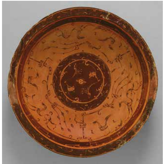
Fig. 16 (above right). Painted bowl, Chinese, 3 rd century BCE. Wood with lacquer, 10 x 2 7 / 16 in. (25.4 x 6.19 cm). Seattle Art Museum, Eugene Fuller Memorial Collection, 51.118.

develop a serious interest in lacquerware. Arguably the most important example of the latter is a black-on-red dish dating to the Warring State period [Fig. 16; Color Plate XII], a piece found in a documented excavation. Lee himself was a collector; the museum bought from him the superb, large Cizhou ware vase dating to the 13 th century [Fig. 17], a work that has inspired both admiration and silly comments about its “vulgarity” (p. 129) on account of its fertility imagery.