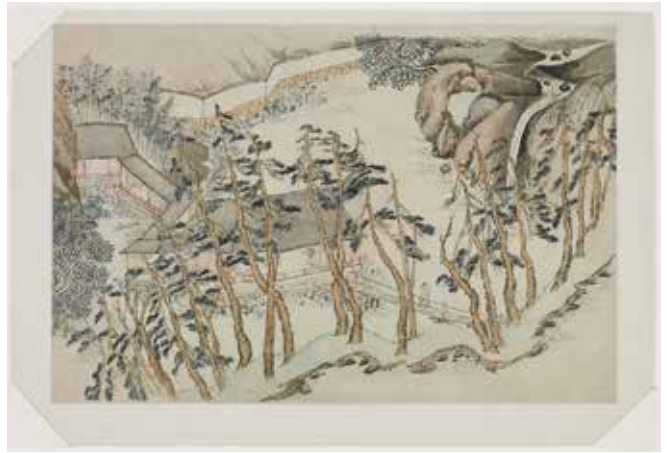
Fig. 12 (above right). "Landscape of dreams," by Shao Mi 邵彌, 1638. One of ten album leaves: ink and color on paper. Overall: 11 7/16 x 17 in. (29 x 43.2 cm). Seattle Art Museum, Eugene Fuller Memorial Collection, 70.18.2.

A number of the most important additions to the collection were made during the short period, 1948–52, when Sherman Lee was Fuller's assistant, hired at a time before he earned what would be a huge reputation in the art world. This was a period when the museum began to build a good collection of early bronzes [e.g., Fig. 15, next page] and became one of the first to