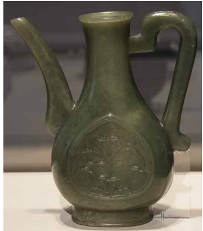
Fig. 1. Chinese nephrite ewer, late 15 th -early 16 th centuries. H: 8 in. Seattle Art Museum, Eugene Fuller Memorial Collection, 33.77.

sources for high-quality Asian antiquities). The relationship between Chinese ceramics and Central Asian or Islamic-world metalwork is well documented, of course. As James Watt observed, this small ewer “is the earliest Chinese jade carving to display Islamic influence” (quoted, p. 31). It dates to a period when a good many objects made of blue-and-white porcelain were decorated with Arabic inscriptions, and craftsmen in China were not only catering to possibly new domestic tastes but also producing for specific export markets in the Islamic world.