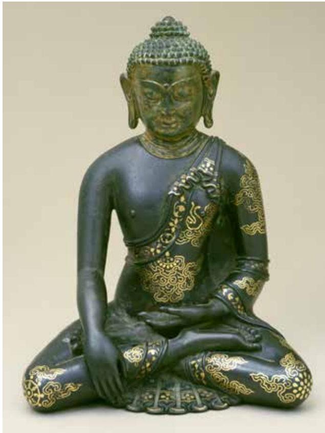
Fig. 24. Seated Buddha, Chinese, 14 th [- 15 th ] century. Bronze with inlaid gold and silver thread. 6 1/2 x 4 1/2 x 3 in. (15.88 x 11.43 x 7.62 cm). Seattle Art Museum, Eugene Fuller Memorial Collection, 69.114.