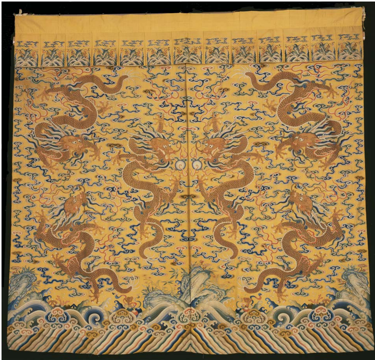
Bed curtains, Chinese, 1735–1796 (Qianlong period). Silk and gold thread, 107 x 70 3 / 4 in. (266.7 x 179.71 cm). Seattle Art Museum, Eugene Fuller Memorial Collection, 33.159.2.