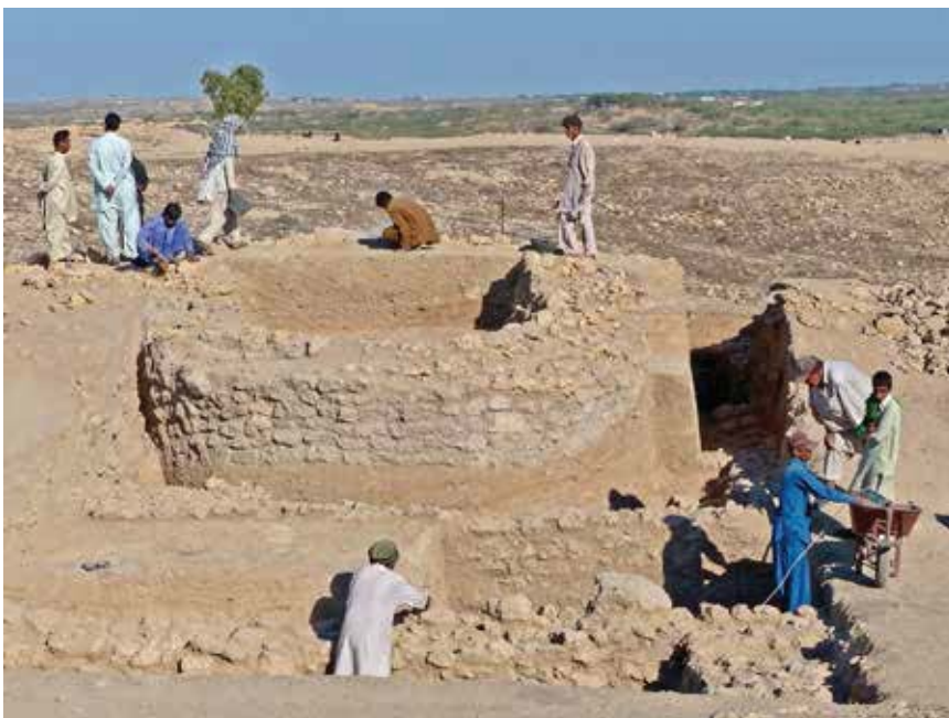
Fig. 5. The 2014 Pakistani-Italian sounding.

The geomorphological and hydro-logic survey and sedimentological investigations and tests carried out during the 2014 season have advanced our knowledge of the changes in the Indus’ course and helped us achieve a better