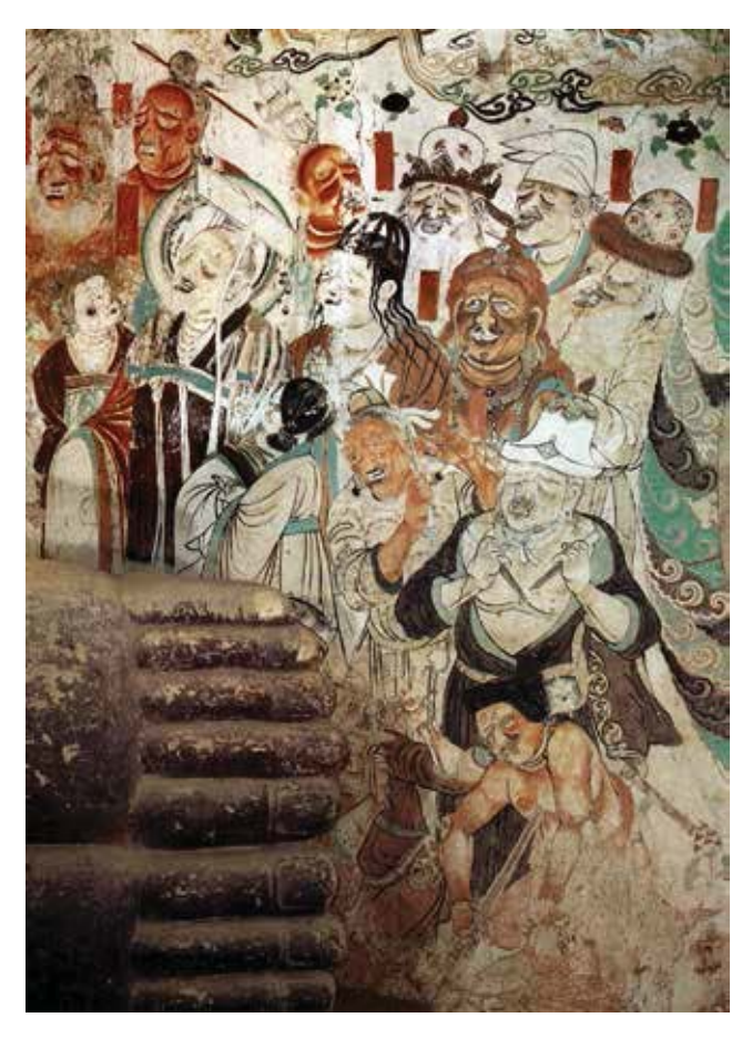
Fig. 5. Mourners depicted on the mural behind the statue of the Buddha in Parinirvana, Mogao Cave No. 158, Dunhuang, Gansu Province. After: Dunhuang Mogaoku 1987, Pl. 65.

Buddhist cave images from along the "Silk Roads" document what can be interpreted as Central Asian mourning traditions. The examples here both depict the death of the Buddha, the Parinirvana , where he is being mourned by his disciples and others. The earliest of these [Fig. 4], dated to the 5<sup>th</sup> or early 6<sup>th</sup> centuries CE, is from the Kizil Caves along the "northern Silk Road" near Kucha.<sup>7</sup> Above the flaming bier with the Buddha's body is a "balcony" with a row of figures dramatically displaying their grief. Two of them are either lacerating their faces or preparing to cut off their noses. The physiognomies of several of the individuals suggest they might be of central Asian ethnicity—in any event, different from the "Indian" appearance of the other figures.