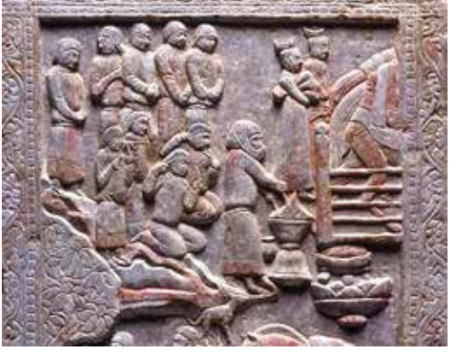
Fig. 3. Detail of panel on the Miho Museum's Sogdian burial couch depicting the Zoroastrian rawanpase, "soul-service".

This scene depicts the service for death in Zoroastrianism which is called rawanpase "soul-service", which is a solemn affair in orthodox Zoroastrianism.<sup>5</sup> The rest of the scene includes a noble lady