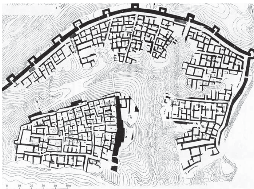
Fig. 2. Plan of the structures of the fortress at Kampyrtepa, drawn by I. Lun'kova and E. Kurkina (p. 197).

Of particular concern here is to establish the exact path of this Indian Road through Central Asia. There certainly is plenty of evidence in the upper Oxus region regarding important settlements, in which there is abundant material from the Graeco-Bactrian and Kushan periods, and where one can with some confidence assert that there were active connections with India. Once there, however, how does one travel westwards? Rtveladze rejects the idea that going down the Oxus to Khwarezm was in the earliest centuries the main option that was chosen, in part because there is so little archaeologically documented coin evidence of the kind one finds in Bactria. Rather, he argues, the Kelif Uzboi (called the Oks in the ancient sources, which sometimes confused it with the Oxus), a tributary of the Oxus, provided the most direct route to Margiana, and from there one could travel directly west