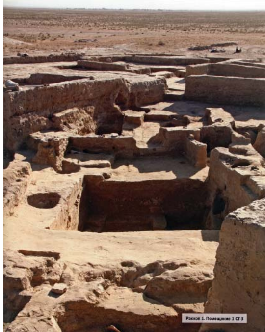
Excavation area 1. Unit 1 SG 3, at Karatobe (p. 232)

houses, heated by tandoors and with masonry “sofas” along the walls of many of the rooms. The housing types are similar to those excavated at Otrar, one of the better known medieval cities of southern Kazakhstan. The author traces the development of this architecture back to much earlier forms in Central Asia and suggests it originated in the adaptation of forms of nomadic dwellings on carts to sedentary life. Other analogies here that are of interest are with the cities of the Volga region of the Mongol Golden Horde, although there the residential quarters had more of an open plan.