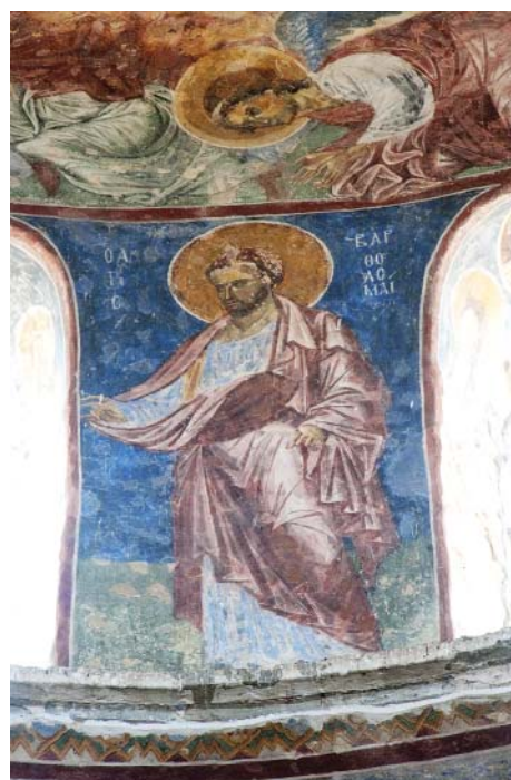
(top) Lapis lazuli carved relief medallions in a gold pectoral, Sasanian Iran, ca. 5 th –6 th century CE. Collection of the Riza Abbasi Museum, Tehran.