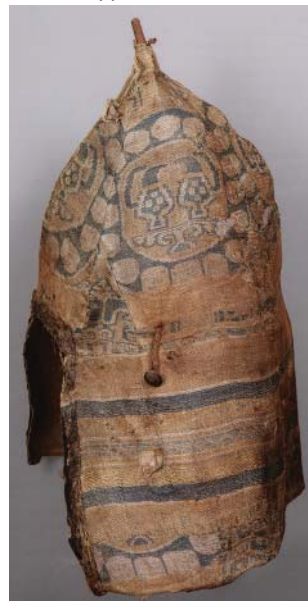
Two of the textiles, a man's cap with paired jugs, and a detail of the caftan with the simurghs (pp. 185, 237).

The textiles are largely small fragments, though there is one spectacular tunic of silk (probably Syro-Byzantine)